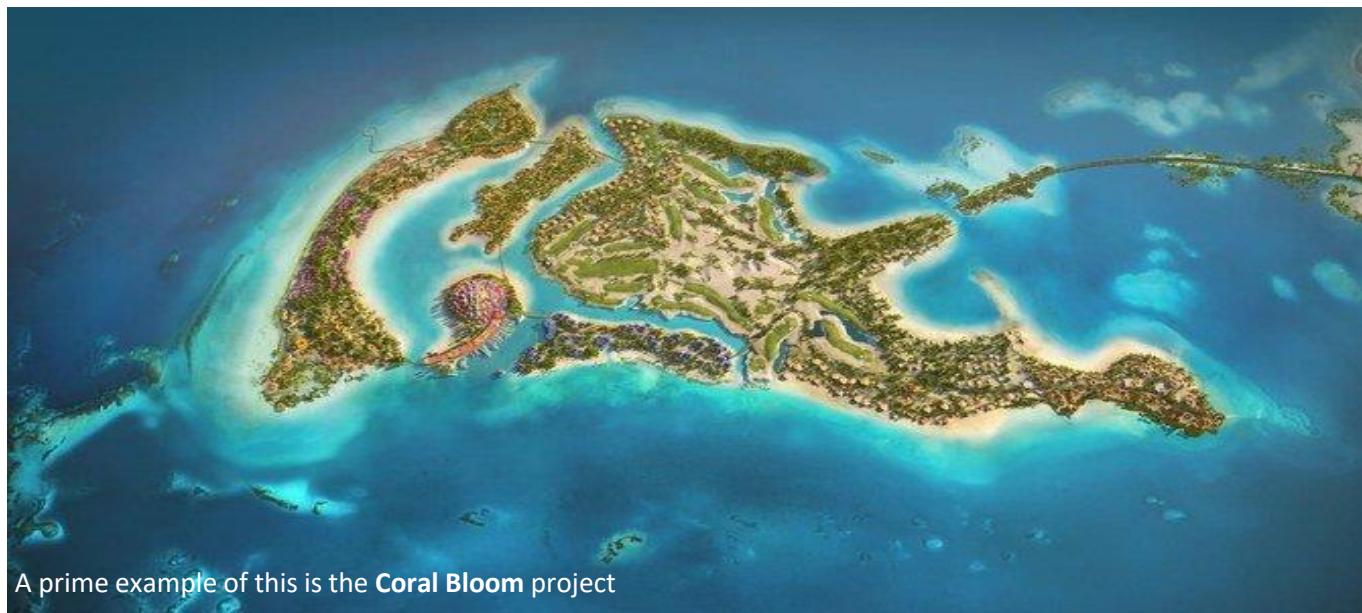
A prime example of this is the Coral Bloom project

had taken major steps in recent years to develop its legislative environment. The aim was to preserve rights, entrench the principles of justice and transparency, protect human rights and achieve sustainable development. The new laws adopt international judicial practices and standards in a manner that does not contradict Sharia principles, the Crown Prince said.